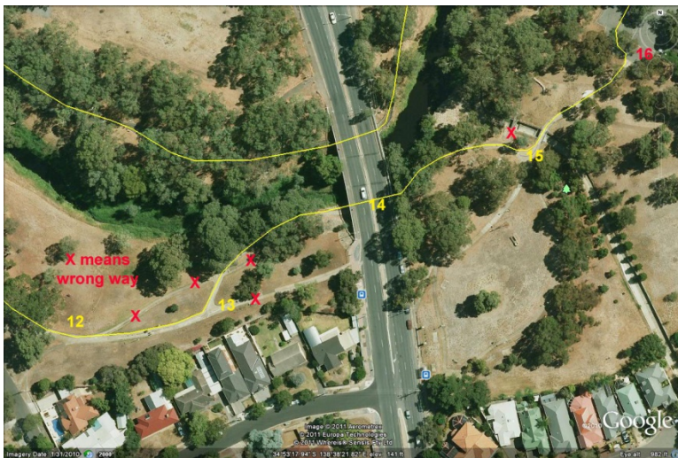
OG ROAD DETAILS