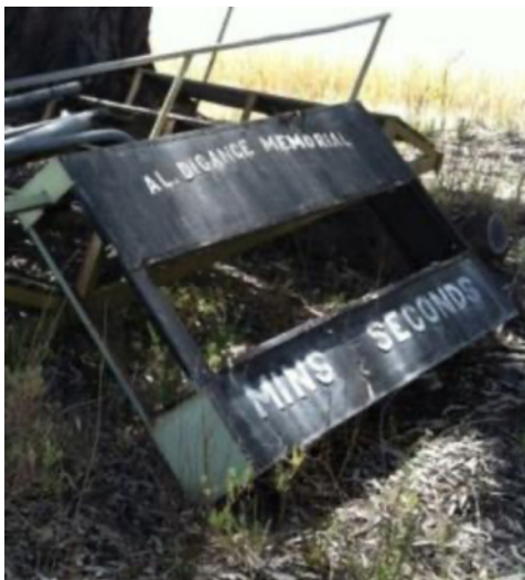
The sad demise of the Al Digance memorial clock